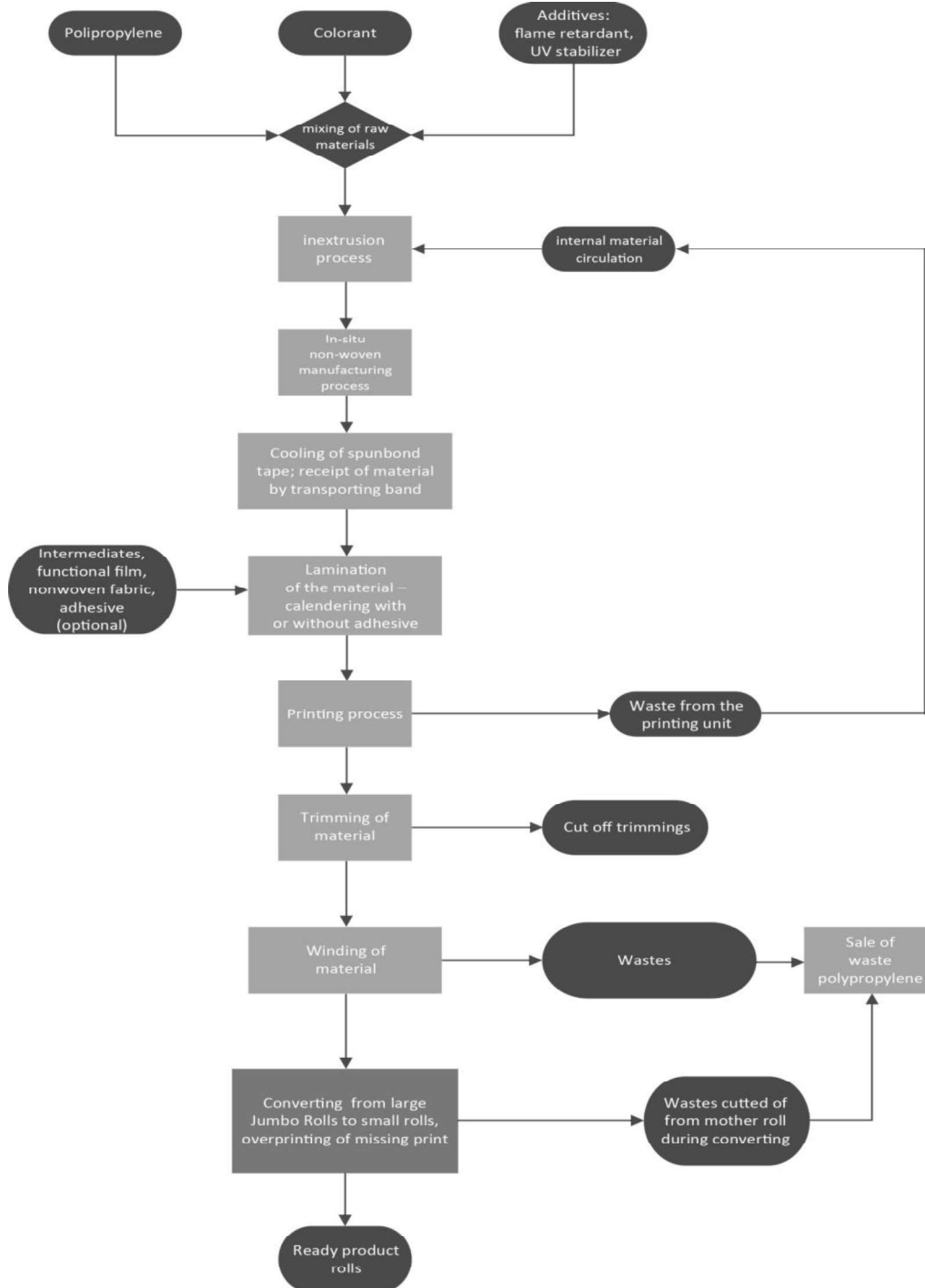
Figure 2 The production flowchart

The flowchart of the membrane manufacturing process is shown below: